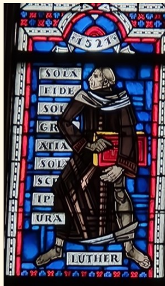
Stained glass window of Martin Luther, St. Peter's Cathedral, Worms

We have seen a lot of change in that last four years due to COVID-19. The Church had a lot of obstacles to overcome and sometimes, things changed day to day, week to week, and month to month. It was an incredibly stressful time for all faith communities. This season pushed us hard; physically, mentally, and spiritually. God was with us, through this wilderness journey, every step of the way.