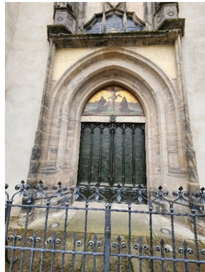
The 95 Theses Door The Wittenberg Castle Church

This Reformation Sunday will be extra special! We will celebrate the Reformation with worship at 9:30 AM with Holy Communion. After worship, I will share stories and pictures from my trip to Germany and the Fellowship Committee will provide an authentic, German meal. I hope that you will be able to join us for this special and festive occasion!